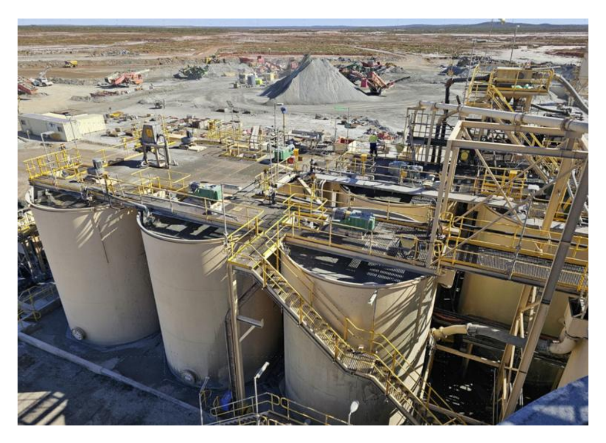
Figure 1: Lakewood Processing Plant